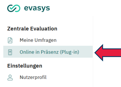
Abbildung 2: To your courses