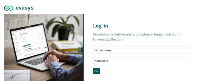
Abbildung 1: The evasys login