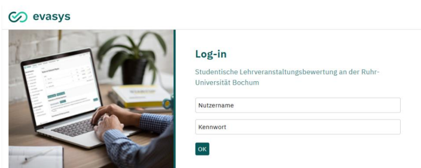
Figure 1: The evasys login