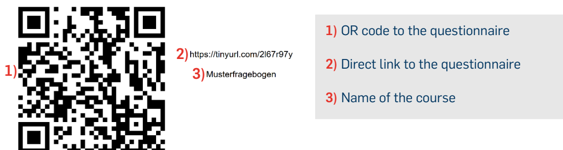
Figure 4: Access data for the course evaluation